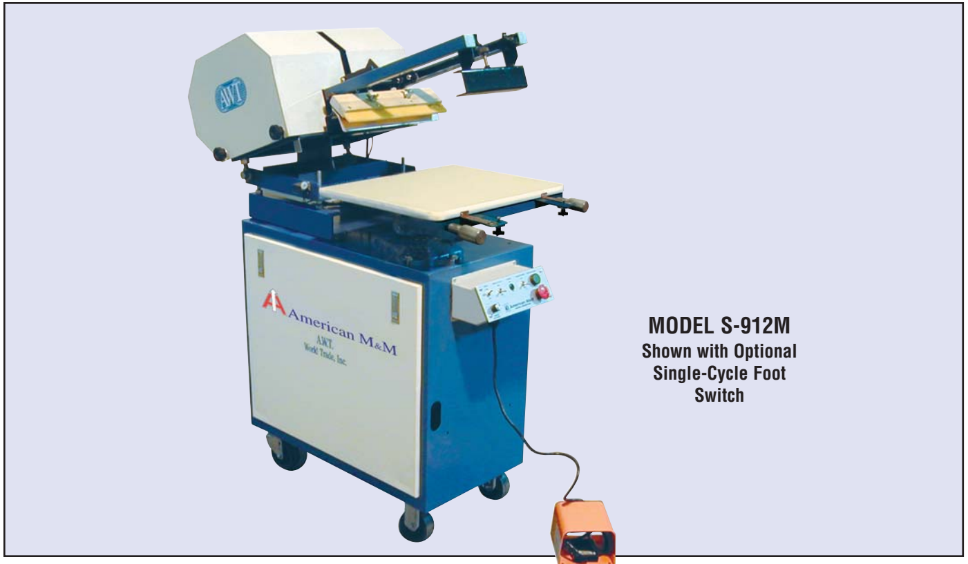
MODEL S-912M Shown with Optional Single-Cycle Foot Switch

If your screen printing work requires only a small-format printer, but you can't do without the automatic operation and precision of larger machines, the S-912M from A.W.T. / American M&M is the perfect choice.